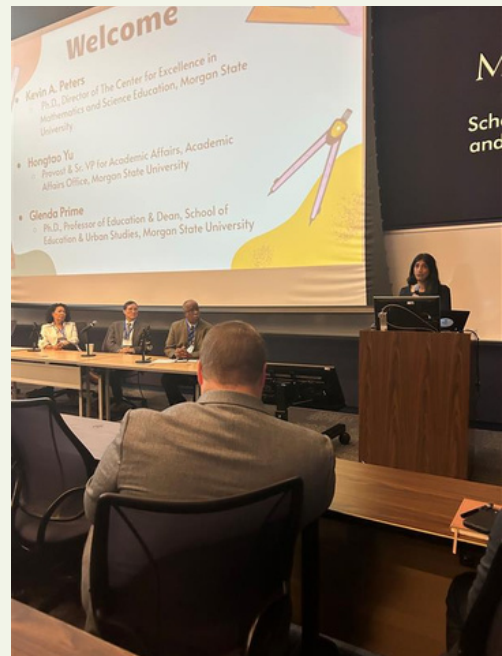
Lieutenant Governor Aruna Miller giving the a keynote address at the Lights on Math in Maryland event on Oct. 26.